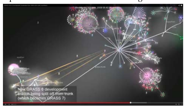
Figure 3: Still frame from a visual analytics animation providing a high level view on the evolving of the GRASS GIS codebase using the Gource software for software version control visualization (Neteler 2013, Grouse 2014).

are already being used and published on Web 2.0 portals, which contain the described limitations regarding citability and long term preservation. Figure 3 provides an example on the current state of the art. However, the tight coupling of multimedia, research data and software repositories enabling reference and citation via DOI remains an active research topic for non-textual information management.