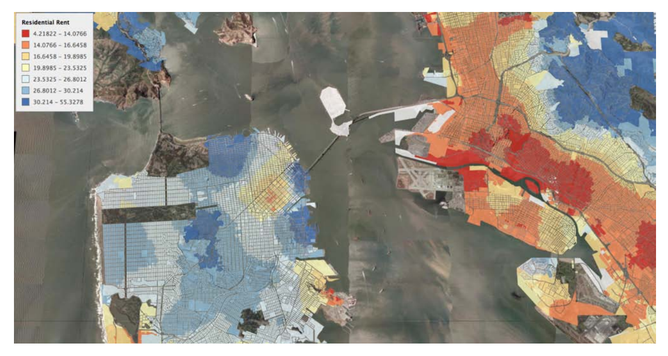
Figure 4: Residential rent in the Bay Area aggregated by network buffer queries.