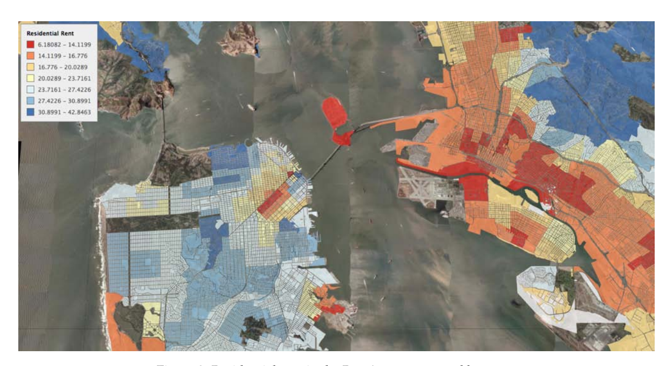
Figure 3: Residential rent in the Bay Area aggregated by zone.